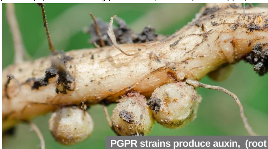
Figure 3. Plant growth-promoting rhizobacteria (PGPR) [Bioscience, S. (2022, September 24)]

Plant Growth-Promoting Rhizobacteria (PGPR): PGPR are those bacteria that live in the rhizosphere of plants and in many ways help the plants to grow through the synthesis of Phyto hormones, solubilization of phosphorus and by protecting the plants from pathogens (Lugtenberg & Kamilova, 2009). Another advantage of using PGPR is that when applied to the crops, it improves the uptake of nutrients by the crops, hence boosting production (Adesemoye & Kloepper, 2009).