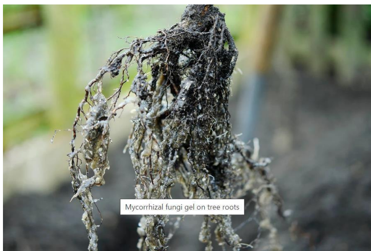
Figure 2. Mycorrhizal fungi gel on tree roots [Bolan N.S. (1991)]